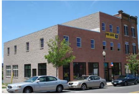
Lower Falls Development