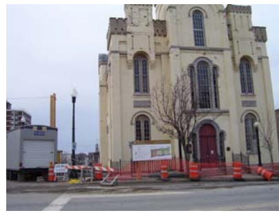
Oswego Public Library