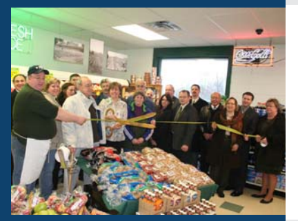
Bosco & Geers Food Market