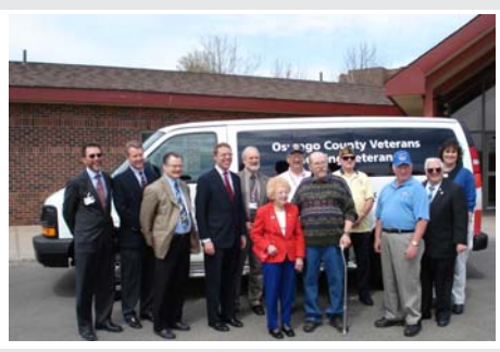
Oswego County Veterans' Services